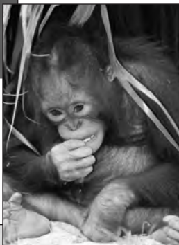
orangutan: man, forest