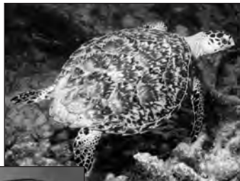
sea turtle: plastic bags, eggs