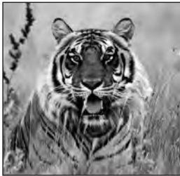
tiger: potions, medicines

rectly, they'll complete the sentences explaining why that animal is endangered. Fill in the blanks with the correct words.