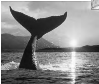
right whale: fishing nets, ships