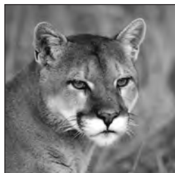
panther: license plates, speeding cars

1. _____ and _____ have been built over areas where the lupine wildflower grows. Lupine is an essential food for my larva. Who am I? _____